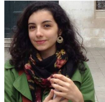
Salma PR & EVENTS